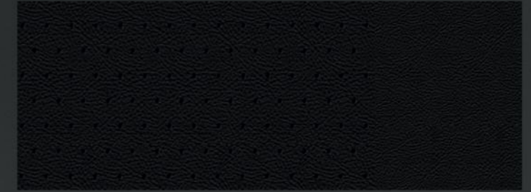
Black "Claudia" leather*, on Allure Level