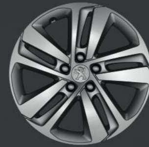
17 inch 'Phoenix' alloy wheels