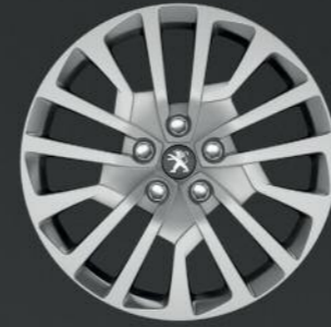
17 inch 'Miami' wheel trims