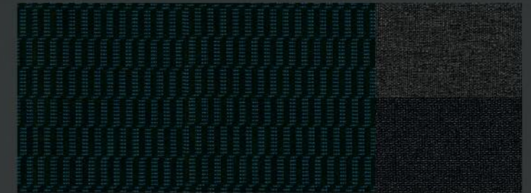
Grey and dark blue "Ocean" cloth trim, on Active Level